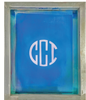
Step 4. End Result