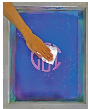
Step 3. Wipe away remaining residue with paper towel