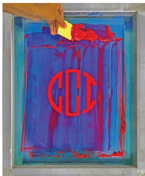
Step 1. Card excess ink from screen