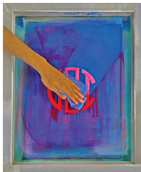
Step 2. Apply envirowipes to both side of screen