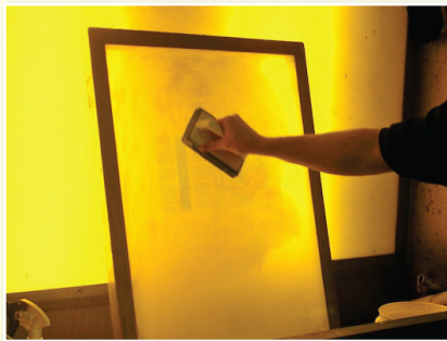
Step 2. Scrub screen with non-abrasive pad or brush. Allow screen to dwell up to 10 minutes.